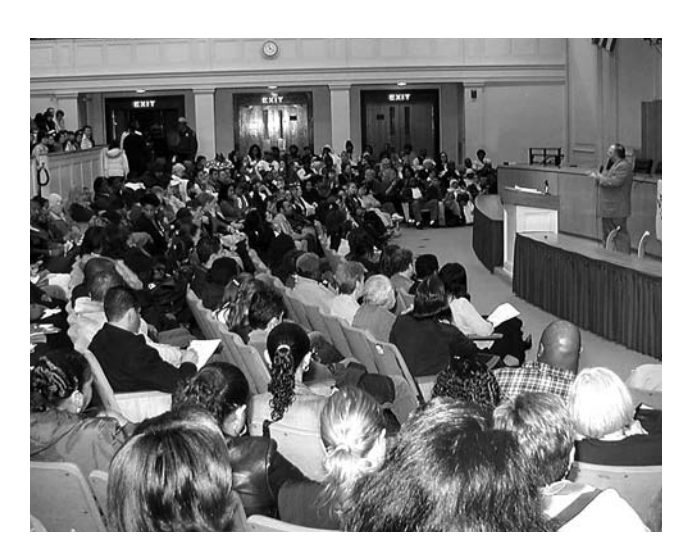
Adult learners in the Massachusetts State House during Adult Learner Awareness Day, March 2007.

Legislators hear from lobbyists all the time but they rarely hear from ordinary people who live in their districts. Visiting is very important!