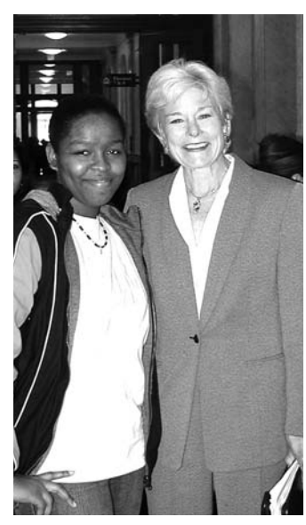
Adult learner with her state representative.