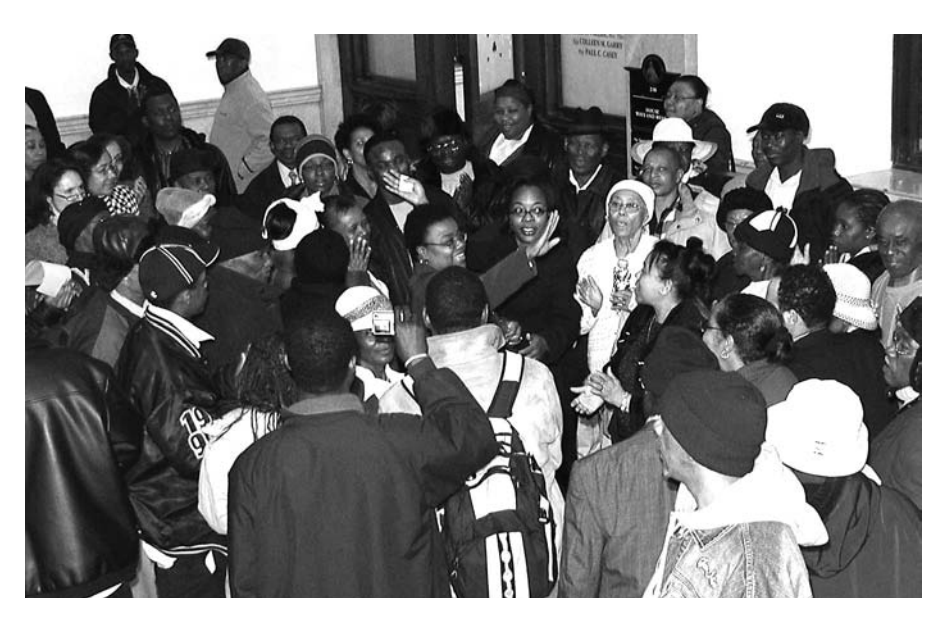
Adult learners in the MA State House during Adult Learner Awareness Day, 3-07.